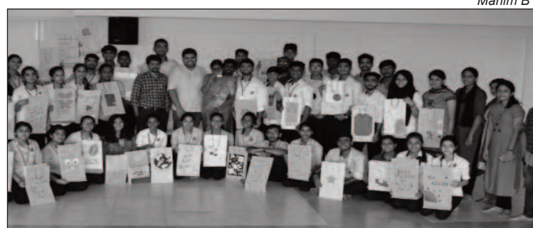
Students with the paper bags they made at the workshop.